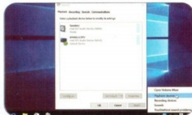
Configuring audio output via an HDMI device or Audio digital devices