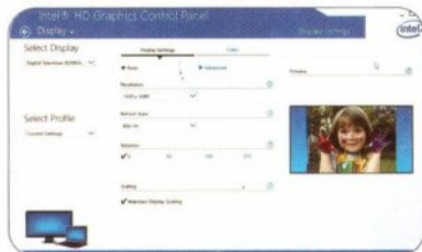
Adjusting the resolution of video output via HDMI to HDTV or Monitor